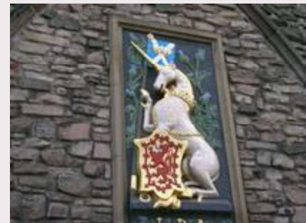
The Coat of Arms outside a Scottish Pub

Other people believe that the lion is stronger than the unicorn and so he put the chains on the unicorn as a symbol of his power. It represents purity, grace, healing and happiness.