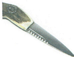
A Sgian Dubh