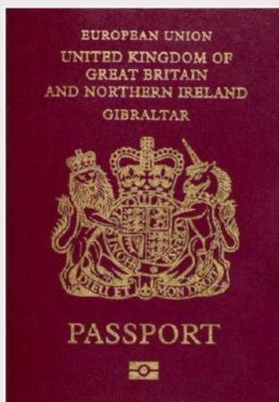
A British Passport

A Unicorn is the National Animal of Scotland and has been since the 15th Century. A unicorn is a horse with a horn but it is not real. You will find the unicorn on a UK Passport with a lion.