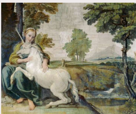
The Purity of the Unicorn

The lion represents England and the Unicorn represents Scotland. The symbol is supposed to represent purity, grace, healing and happiness. It also represents togetherness' but now it is a little bit more difficult because some people in Scotland want to leave Britain and become their own country.