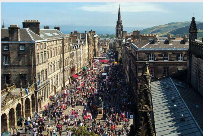
The Royal Mile during The Fringe

During the Fringe, Edinburgh is very busy. The size of Edinburgh triples during the Fringe.