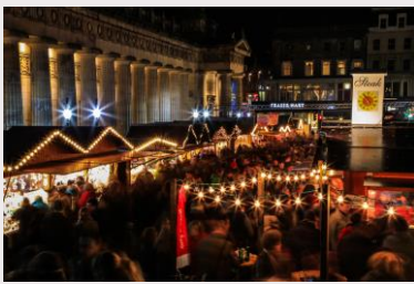
Edinburgh Christmas Markets

In Edinburgh there is a castle which sits right in the centre of the city on a big hill and there is also a volcano called 'Arthur's Seat'. If it's nice weather, you can walk and climb up the volcano but if it's rainy you might need an umbrella. The weather in Scotland is very similar to Normandy – windy and rainy. You can also visit the beach called 'Portobello'.