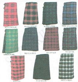
Examples of different Tartans

Kilts are the typical traditional clothing in Scotland for men. A kilt looks like a skirt but is typically for a man and a skirt is typically for a woman. Most kilts have a tartan. There are different types of tartan which depend on the type of wool available in that region. This is because families tended to live together in the same region, different tartans became associated with certain families.