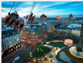
Edinburgh from the sky

There are two big parks in Edinburgh. One is called the Meadows which is used for the Marathon. This is very boring because the runner has to run around the meadows 18 times but it is for charity. Another big park is called the Princes Street Gardens which can be used for the Christmas Markets.